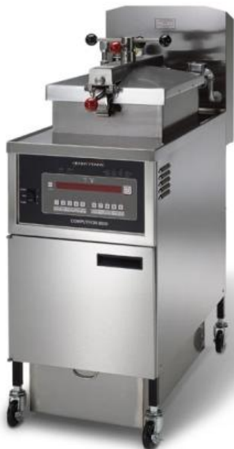
PFE 500 electric pressure fryer with Computron™ 8000 control

Henny Penny first introduced commercial pressure frying to the foodservice industry more than 50 years ago. Frying under pressure enables lower cooking temperatures for longer oil life, and faster cooking times to meet peak demand. Pressure also seals in food's natural juices and reduces the amount of oil absorbed into product.